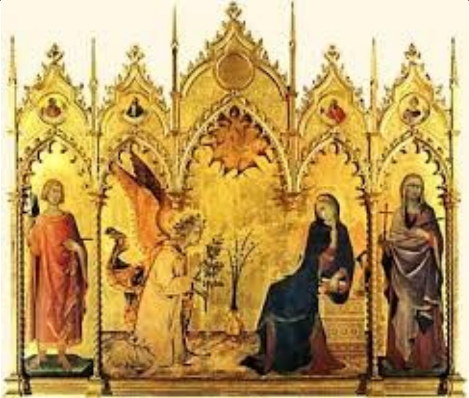
Simone Martini: Annunciation: Uffizi Gallery

In the Uffizi Gallery in Florence there is a wonderful painting of the Annunciation by the 13th century Italian artist Simone Martini. In it a gentle and serious-faced angel kneels at the feet of Mary, and Mary is backing away in fear.